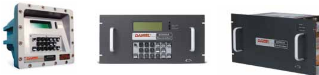
The 2350A Gas Chromatograph Controller offers an explosion-proof design or rack-mount placement, with an optional keypad and display window.