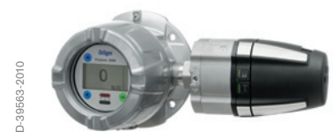
Dräger Polytron 8720 Flameproof transmitter for monitoring carbon dioxide

Dräger has been developing and manufacturing sensors and gas detectors for industrial use for more than 40 years. And with each new device generation, we drive our measurement technology a bit further. With the Polytron 8720, you will definitely benefit from this experience and power of innovation. Its DrägerSensor is based on an open, double-compensated optical infrared system.