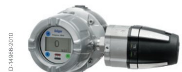
Dräger Polytron 8720 Connected e-Box to be wired in increased safety.