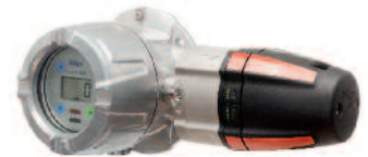
Dräger Polytron 5700 Flameproof transmitter for monitoring combustible gases and vapors.