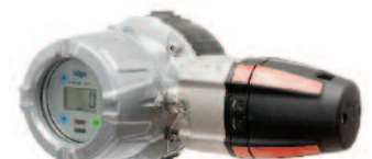
Dräger Polytron 5700 With e-box attached: version for increased safety wiring.