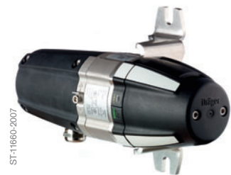
Dräger PIR 7200 Configurable IR gas detector for reliable detection of carbon dioxide