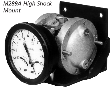
M289A High Shock Mount